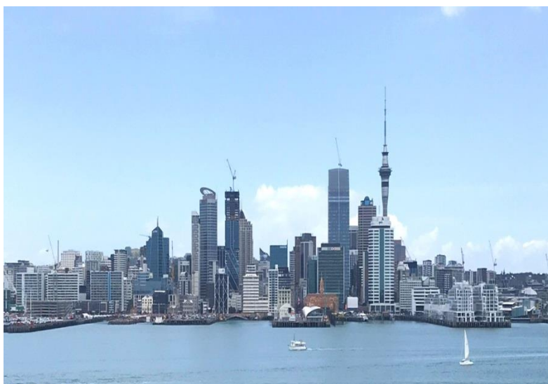
Oakland skyline & Bridge 奧克蘭天際線及大橋