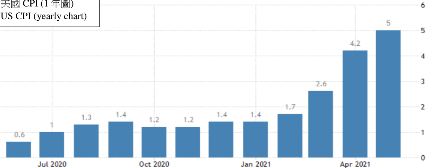
美國 CPI (1 年圖) US CPI (yearly chart)

本刊自 2015 開始被翻譯成俄羅斯文在歐洲同步發行 This bulletin is being translated into Russian since